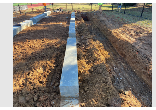
Description Excavate Infiltration Trench - Washington HS